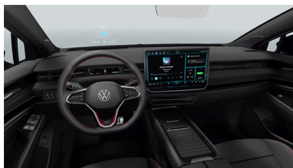
Soul Black - Red (ZQ) Standard from ID.7 GTX PLUS

Note: The print processes do not allow exact reproduction of the upholstery & insert colours.