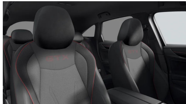
Inserts of front seats and outer rear seats in perforated ArtVelours ECO microfleece, seat bolsters in Artex (GTX) Soul Black - Red (ZQ) Standard from ID.7 GTX PLUS

Note: The print processes do not allow exact reproduction of the upholstery & insert colours.