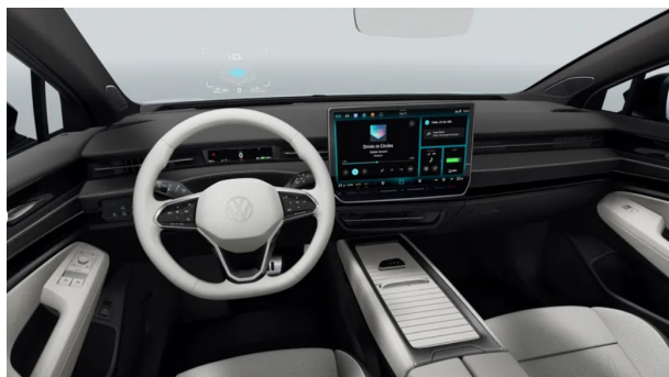
Mistral / Soul Black / Grey Detail / Shite Steering Wheel (AK) Optional from ID.7 PRO PLUS / PRO S PLUS (forces option package PBF)