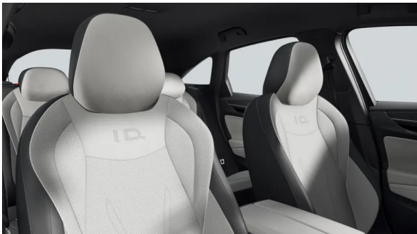
Inserts of front seats and outer rear seats in perforated ArtVelours ECO microfleece, seat bolsters in Artex Mistral / Soul Black / White Steering Wheel (AK) (forces option package PBF) Optional from ID.7 PRO PLUS / PRO S PLUS