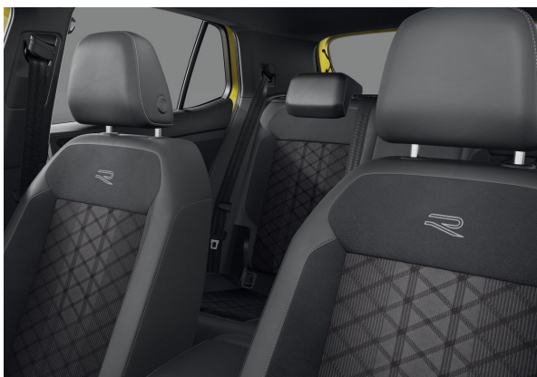
Gray - Titanium Black (WG) Standard on R-Line