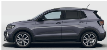
Smokey Grey Metallic *