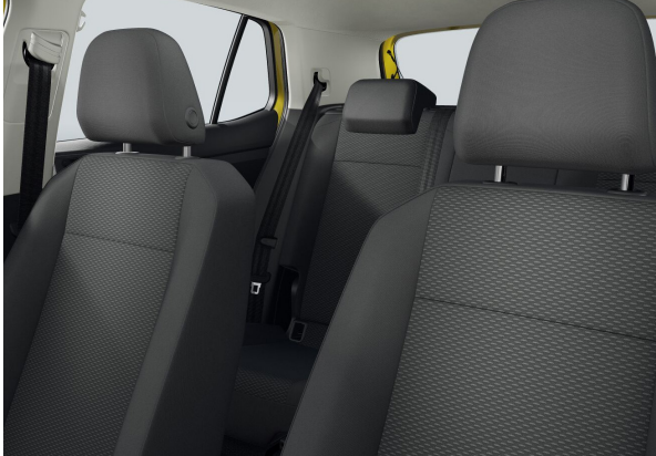
Titanium Black (EL) Standard on T-Cross