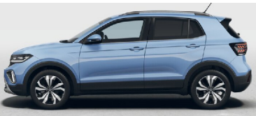
Clear Blue Metallic *