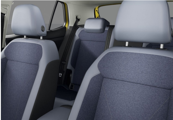
Cosmic Blue - Titanium Black (WG) Standard on Style Not available with colour Kings Red (P8P8)