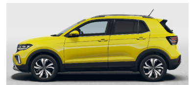
Grape Yellow Solid *