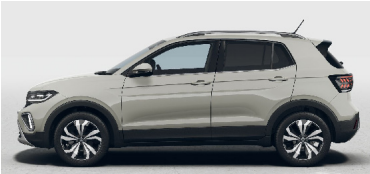
Ascot Grey Solid *