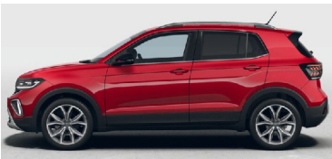
Kings Red Metallic *