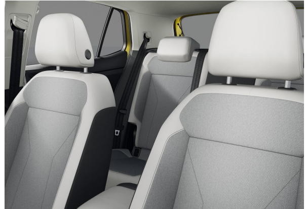
Mistral Titanium Black (SV) Optional on Style (Only with pack PAD)