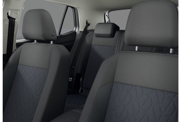
Melange Gray (QV) Standard on Life / Edition 75